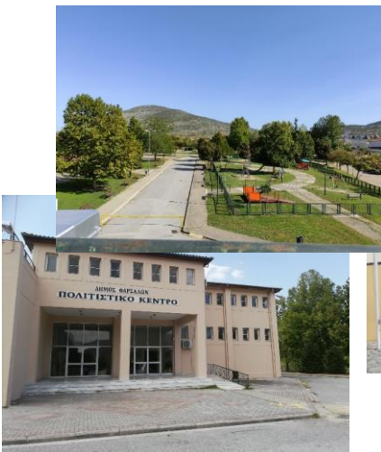
Farsala – Cultural Center