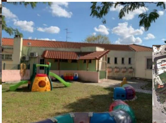
Nursery of Didymoteicho