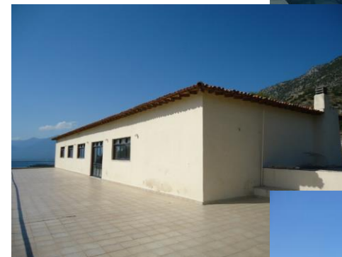
Athens School of Fine Arts - Delphi