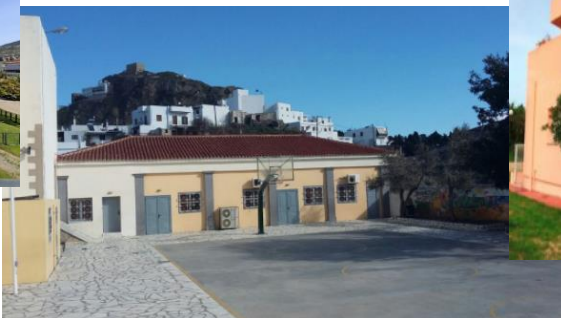
Skyros – Primary School