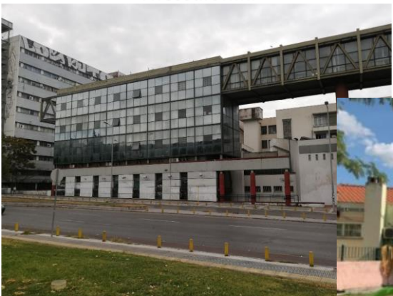
Aristotle University of Thessaloniki