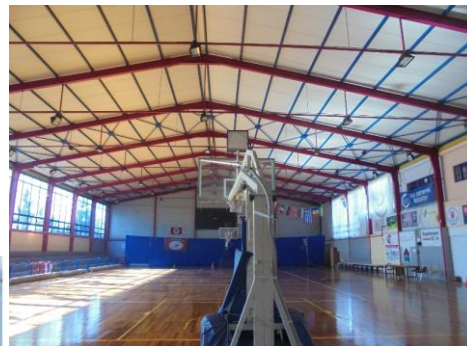
Indoor Gym of Moschato